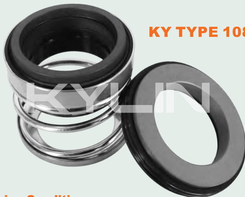
KY TYPE 108